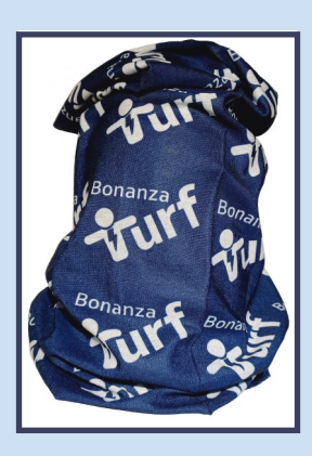
Bonanza Multiheadwear 75 SEK