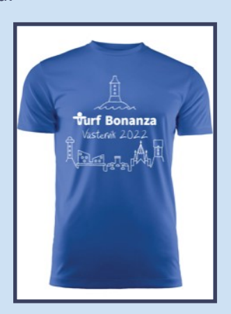
Bonanza T-shirt blue 170 SEK