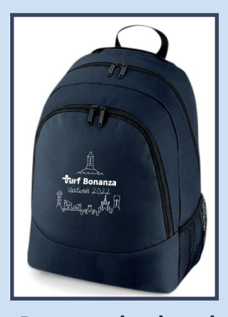
Bonanza backpack, navy blue 275 SEK