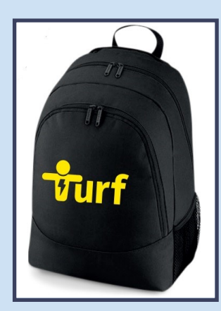
Turf backpack, black 275 SEK