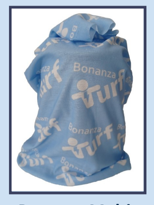
Bonanza Multiheadwear 75 SEK