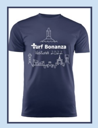
Bonanza T-shirt, navy blue 170 SEK

Participating in a Bonanza is traditionally free - you pay no registration fee! In order to be able to carry out the Bonanza, we are also dependent on the participants giving their support by purchasing Bonanza T-shirts and other Turf items that we have to offer. For the Bonanza in Västervik, you can choose from the following items! Ordering is done via the registration form. You pick up your items up when you check in at the event area.